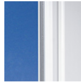
Classic design with soft contours