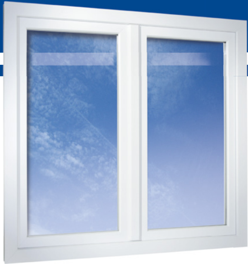
2-part-casement window, recessed